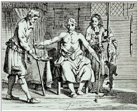
Figure 1. Blood transfusion in 17th Century.