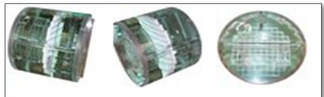
Figure 1. ACR MR Phantom.

It is made of acrylic plastic, glass, silicone. Ferromagnetic materials were removed. It is 20.4 cm in diameter and 16.5 cm in length. There are 11 mm thickness resolution components. The width between the halls is 1.1 mm, 1 mm and 0.9 mm (Figure 1) [11]. Target volumes were determined on the phantom (Figure 2).