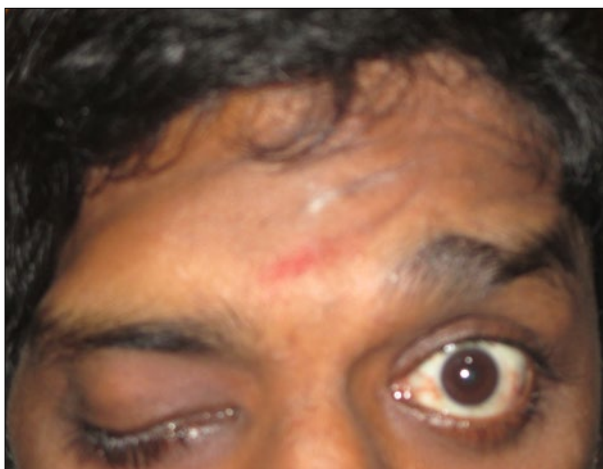
Figure 3. Limited right eye movements in all directions except abduction. The right lid is held open with finger.