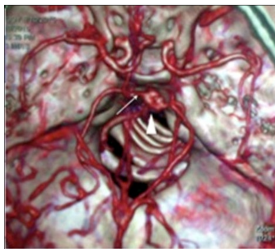
Figure 1. CT-angiography detected a bilobed saccular aneurysm (arrowhead) originating from the basilar artery tip and P1 junction coursing upwards, measuring 0.70 \times 0.45 cm with mild vasospasm of the P1 segment of right posterior cerebral artery (arrow).

A 31 year old gentleman with hemorrhoids since childhood was rushed to the emergency room five months ago with intense headache and an episode of hematemesis. Ultrasonography of the abdomen was normal. Neuroimaging ( Figure 1 ) had revealed a basilar artery tip aneurysm with “mild vasospasm” of P1 segment of the right posterior cerebral artery. A week later, an inadvertent intraoperative aneurysm rupture had necessitated the use of “forced” temporary clipping. Consequently, he was ventilator-dependent in the immediate postoperative period. On regaining consciousness, he reported inability to open the right eye, asymmetry of the mouth with weakness of the left arm and leg.