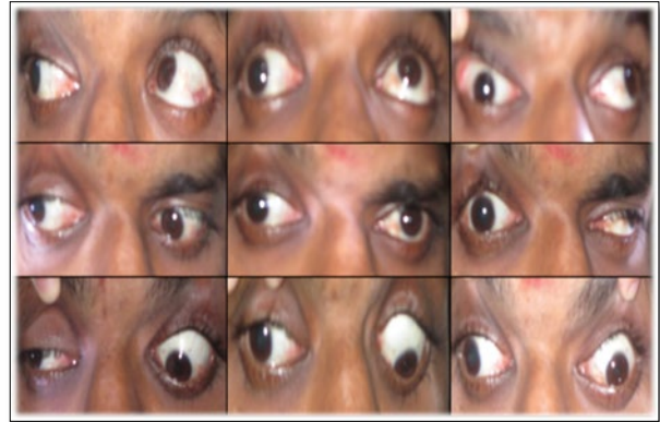
Figure 4. Loss of left nasolabial folds with deviation of angle of the mouth to the right indicating left buccinator weakness.