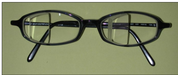
Figure 1. The glasses of a patient with right homonymous hemianopia, showing the Palomar attaches prisms, whose bases are oriented towards the right.

The report describes the binocular adaptation of Palomar prisms in a young patient with right homonymous hemianopia 28. Central visual field restoration, which did not require compensatory eye movements, was achieved through careful selection of prism power from a trial set, while precise prism positioning was essential to avoid central diplopia [17] ( Figure 1 ). The patient did not present in any central diplopia with Palomar prisms adapted binocularly, as described by other authors [10,29,30,33].