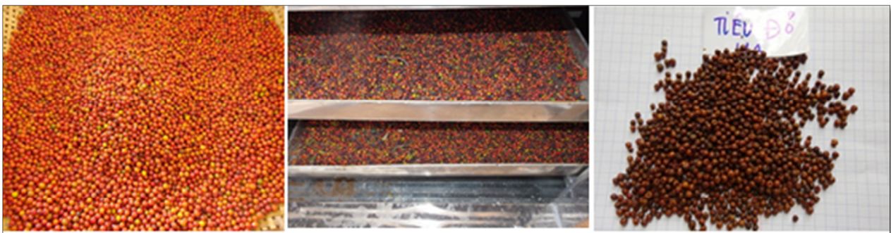
Figure 3. Peppercorn before, during and after drying by heat pump drying.