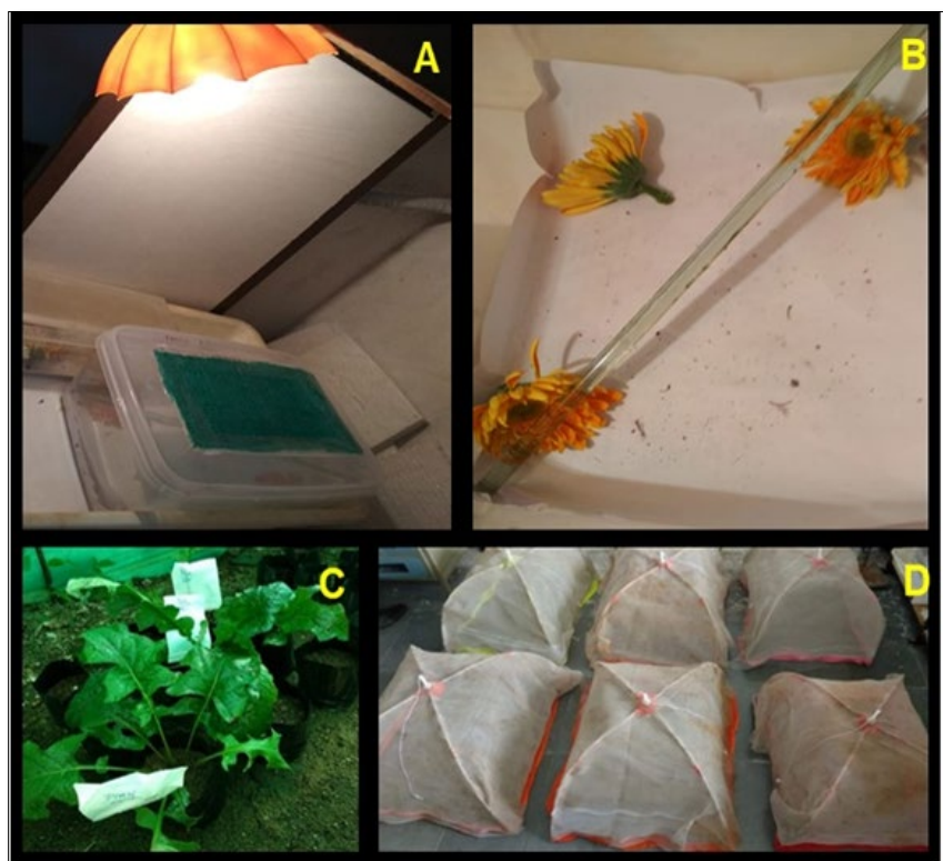
Figure 1A-D. WFT rearing under laboratory conditions (A), Food bait with excised flowers and sucrose (10%) solution on glass rod for egg deposition (B), WFT infestation on floral buds of whole plant (C) and Randomized WFT treatment block covered with 60 mm nylon membrane (D).

The emerging 3-day old flower buds of White, Pink, and Yellow cultivars of Gerbera were infested with an equal number of adult WFT (about 20 no's) and left for 3 days in a separate block covered with a nylon filter (30 µm) grown under greenhouse conditions ( Figures 1C-D ).