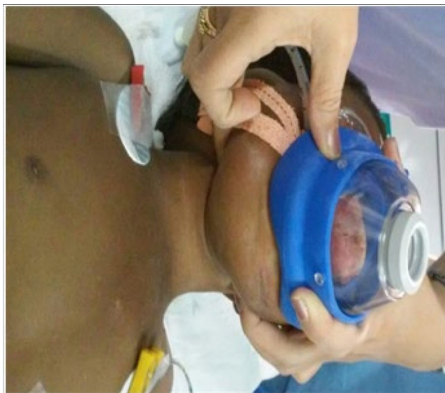
Figure 2. Mask ventilation with size 3 mask.