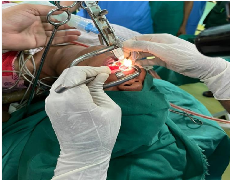
Figure 1. Foreign body being removed.

taken under GA and a round glass of a torch measuring around 5cm in diameter was removed. The exposure was achieved using a Boyle davis mouth gag with tongue depressor and the FB was visualized. Then using an anterior pillar retractor, it was grasped and removed with the help of Dennis brown tonsil holding forceps and later Magill forceps. The patient stood the procedure very well and was kept NBM for next 24 hours again. No laceration or injury were found on laryngoscopy later ( Figures 1 & 2a, b ).