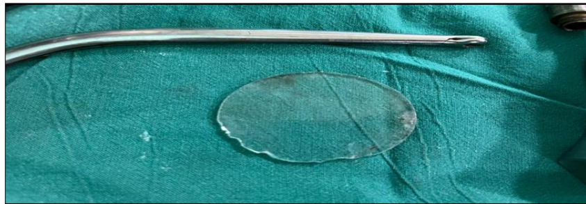
Figure 3. The Removed Torch Glass.

While guidelines for intentional glass ingestion may not differ significantly from those for other foreign body ingestions, the unique aspect lies in addressing the psychological and emotional factors that led to the behavior. Mental health and emotional support are vital components of the care plan for individuals who intentionally ingest foreign objects, including glass ( Figure 3 ) [1].