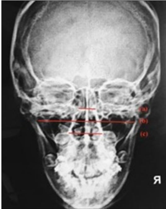
Figure 4. Areas showing expansion.