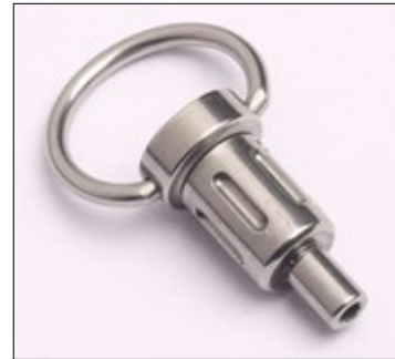
Figure 3. Mini screw.

India) can be used to maintain adequate insertion angulation and torque while placing the mini screws. This unique design of the driver makes it very convenient to place the palatal implants with great ease and precision (Figure 3).