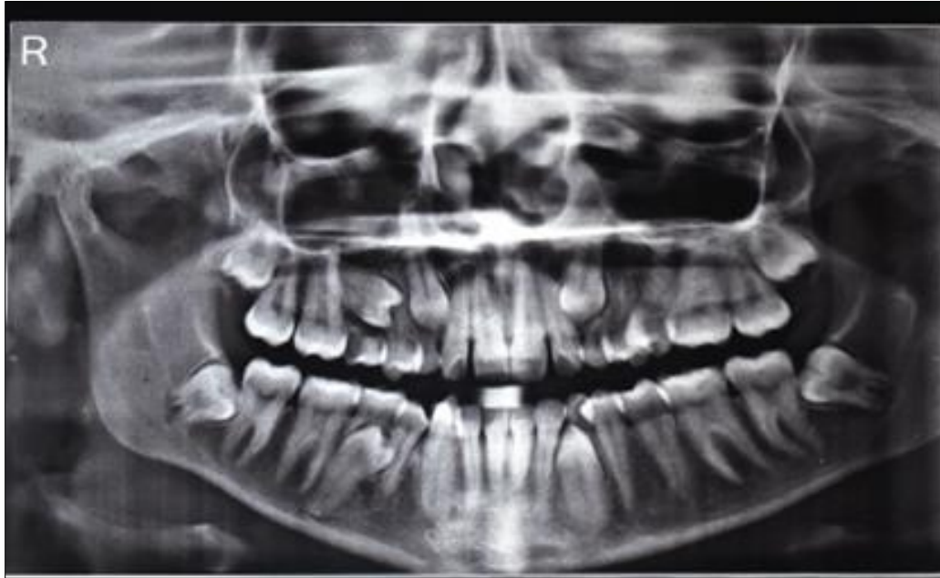
Figure 6. Panoramic radiograph.

some resorptions of deciduous teeth were present ( Figure 6 ). The treatment plan selected in this case was surgical exposure and orthodontic traction for eruption of impacted teeth. If patient does not respond to orthodontic traction, then surgical extraction and prosthetic treatment would be required.