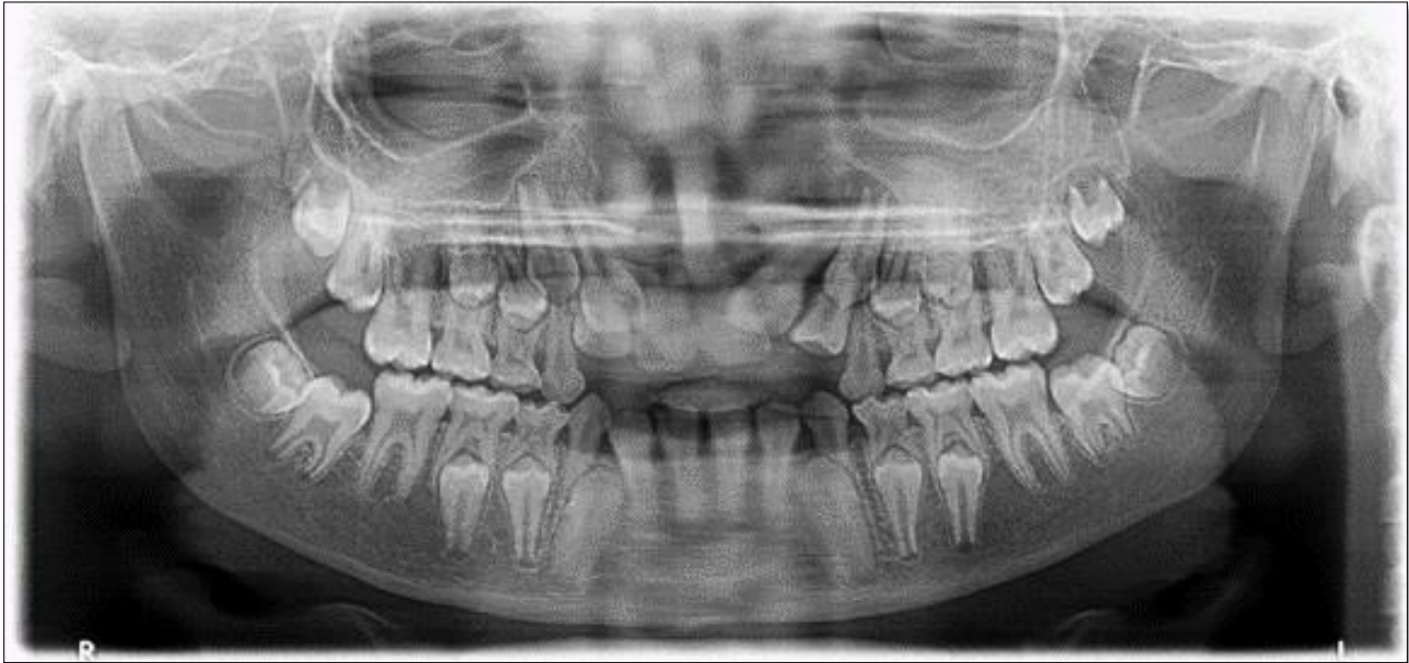
Figure 2. Panoramic radiograph.

Enamel and pulp chambers appeared normal. Roots of central and lateral incisors were complete while that of canines and premolars were partially formed ( Figure 2 ).