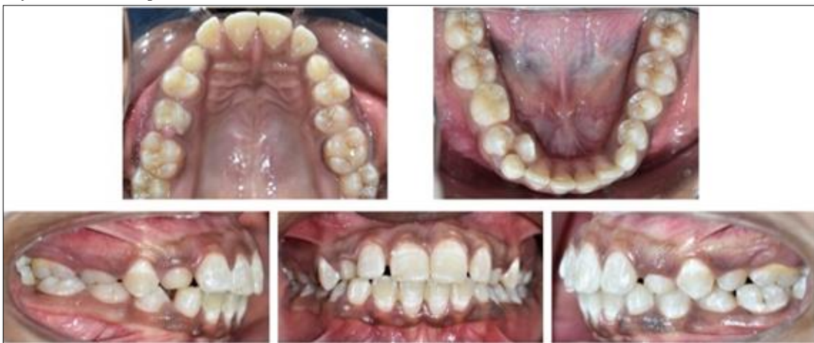
Figure 5. Intra oral photographs (Pre-treatment).