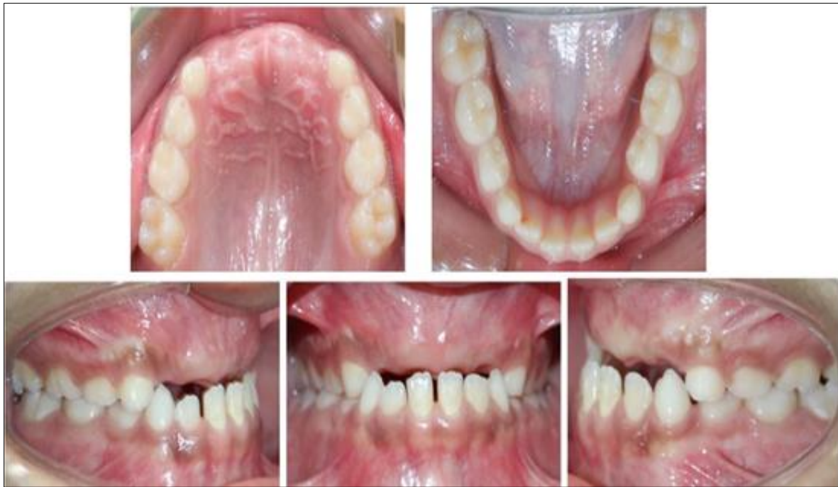
Figure 1. Intra oral photographs (Pre-treatment).

On clinical examination it was found that 20 teeth were present out of which upper central and lateral incisors were missing, lower incisors and all first molars were permanent teeth and rest were deciduous teeth. Lower incisors seemed to be partially erupted. Overjet and overbite could not be assessed. Maxillary and mandibular arch form were oval and symmetrical ( Figure 1 & Table 1 ).