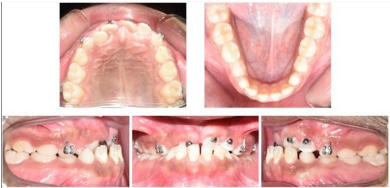
Figure 3. Intra oral photographs (mid-treatment).

and molars in maxilla and mandible were present and were not mobile. Permanent second molars were present in all the quadrants. The panoramic radiograph was done and it was found that roots of upper and lower premolars and canines were almost completely formed and there was almost no resorption of roots of deciduous teeth ( Figures 3 & 4 ).