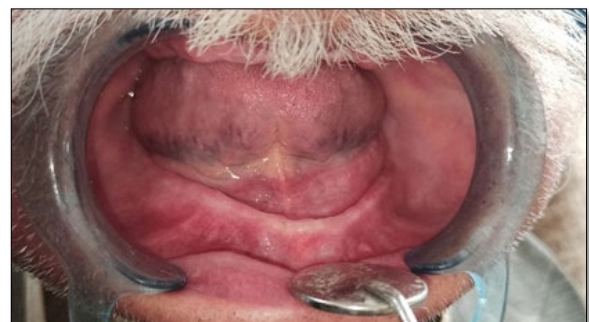
Figure 1. Severely resorbed ridge.

mandibular study models were made. Orthopantomogram (OPG) was undertaken to assess the bone for selection of implants ( Figure 2 ). As the old denture of the patient was not fitting appropriately for implant supported prosthesis, a new prosthesis was fabricated for the patient in accordance with the physiological and functional aspects. Lower denture was used to fabricate surgical stent.