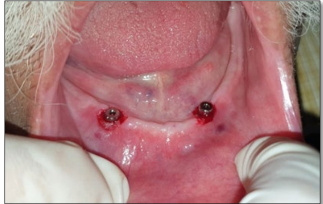
Figure 5. Healing abutments placement.

The standard post-operative surgical protocol was maintained and patient was asked not to use lower denture for three weeks. After three weeks, lower denture was locally relined with soft liner. After six months of the integration period, a definitive prosthodontic therapy was started by exposing the cover screws of implants. 3.8 mm flared bioline healing abutments were placed to establish per mucosal seal ( Figure 5 ).