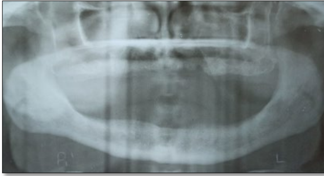
Figure 2. OPG of edentulous ridge.

The bio line narrow platform implants; size 3.5 mm × 13 mm and 3.75 mm × 13 mm were placed by surgically raising flap in canine-to-canine region ( Figures 3 & 4 ).