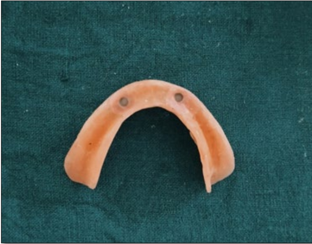
Figure 7. Intaglio surface with metal housing.

According to individual patient's usage and needs, the retention can be gradually increased by changing to higher retentive caps. During a recall appointment, with help of a locator core tool these plastic resilient caps can be easily changed chairside. With the help of an angle measurement guide, the angulation between the implants can be measured, thus helps in the selecting a specific male resilient cap.