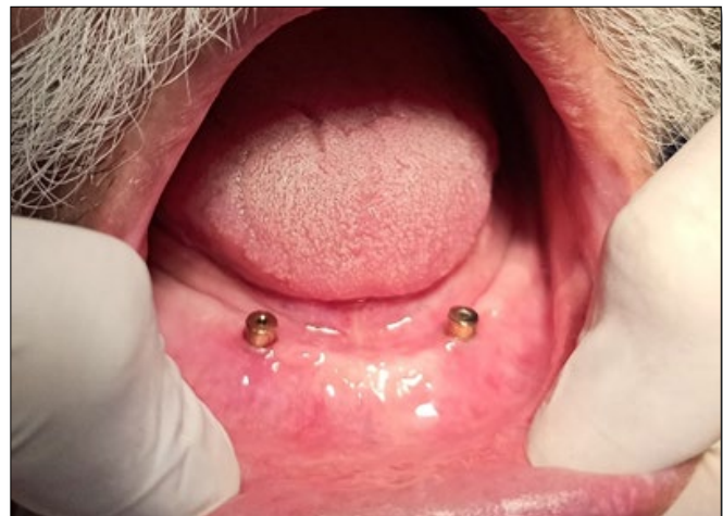
Figure 6. Locator abutments placement.

The healing abutments were removed after duration of two weeks and depth measurements from the implant platforms to the most coronal aspect of the surrounding gingival levels were taken with the help of World Health Organization periodontal probe. Locator Implant Abutment height was measured by calculating the total soft-tissue depth and subtracting 0.5 mm for the platform shifting area of implant. In the above case, on one side 3 mm and other side 3 mm locator abutments were placed with the help of a special gold-plated Abutment Driver ( Figure 6 ). The abutments were tightened to 25-30 N with the help of a torque wrench. The plastic resilient male cap with the metal housing was processed into the denture by directly picked chair side, which allows denture to be snapped into the locator abutments. The chairside pick-up procedure is same as the ball attachments. In this procedure, chair side pick-up procedure with auto polymerizing resin was performed and standard male inserts were given to patient ( Figure 7 ).