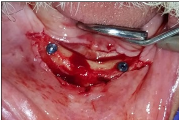
Figure 3. Implant insertion in canine-to-canine region.

The bio line narrow platform implants; size 3.5 mm × 13 mm and 3.75 mm × 13 mm were placed by surgically raising flap in canine-to-canine region ( Figures 3 & 4 ).