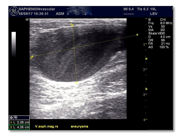
Figure 5. Aneurysma of GSV at the junction sealing therapy possible.

sensations in connection with treatment by Laser and Radiofrequency [11,12] (Figures 5 and 6).