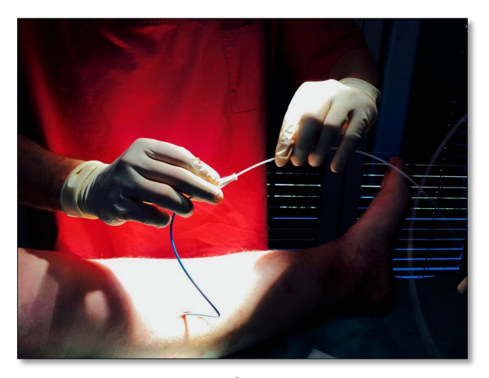
Figure 2. VenaSeal® - Closure technique.

In addition, 16 years ago, far from the beaten tracks of radio wave and laser, the development of a fascinatingly simple, yet nevertheless highly effective method of sealing veins - the VenaSeal® closure technique - was initiated. After CE - approval had been granted in the autumn of 2011, a number of vein centers in Germany and Europe started using the VenaSeal® - system. By now, 35 centers are working successfully with the new therapy system in Germany alone. Today there is an approval in all countries, also in the USA since 2/2015 (Figure 2).