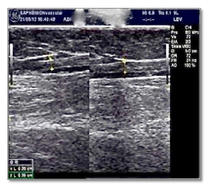
Figure 3. Typical ultrasound of GSV after sealing.

All patients are given a follow-up examination by duplex sonography in the scope of a prospective study (our own quality management) on the 1<sup>st</sup>/14-30<sup>th</sup>/70-90<sup>th</sup> day as well as after 6 and 12 months. After this, we controlled every following year. Nearly all duplex sonography examinations post-intervention was done by another colleague, not by the vascular surgeon treated the truncal veins ( Figure 3 ).