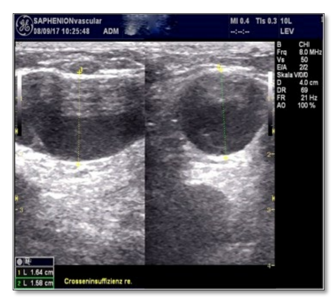
Figure 7. Sealing ectatic and aneurysmatic parts of truncal veins is also possible - ultrasound from SFJ - aneurysm.

By now, VenaSeal® has undeniably become at SAPHENION the therapy of the first choice for the treatment of the SSV. Here, we meanwhile consider the well-known risk of neurological side effects and complications associated with the application of the laser and radio frequency techniques as being too high [3-6,13-15,18].