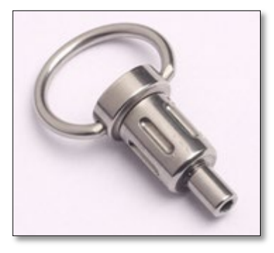
Figure 3. Mini screw.

India) can be used to maintain adequate insertion angulation and torque while placing the mini screws. This unique design of the driver makes it very convenient to place the palatal implants with great ease and precision (Figure 3).