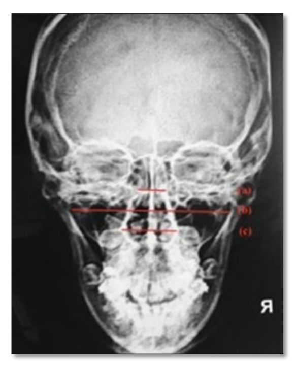
Figure 4. Areas showing expansion.