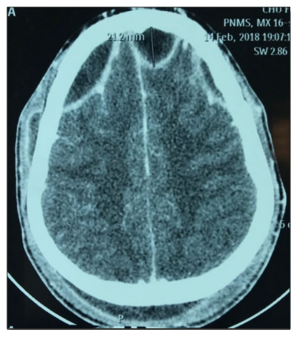
Figure 3. Extradural empyema.Table 4. Neurological sequelae.