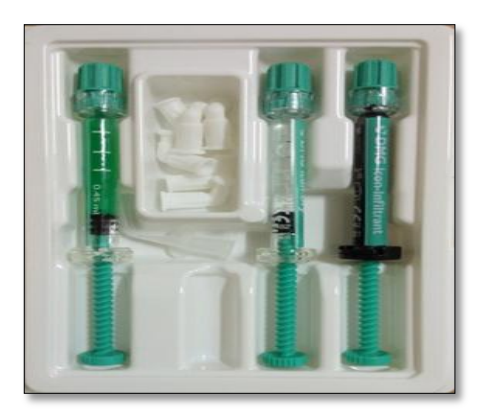
Figure 1B. ICON resin infiltration kit with ICON®-Etch, ICON®-Dry and ICON® Infiltrant.