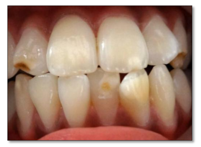
Figure 3A. Preoperative photograph showing defects on 21,12,31,32.

A ten year old boy and his parents reported to our OPD with deep concern about multiple white opacities on upper and lower anterior teeth. On examination it was noticed that WSL on 21,31,32 and frank cavitation on 12 ( Figure 3A ). The treatment options were explained to parents and they opted for resin infiltration technique. Since there were multiple opacities, parents opted to start with lower anteriors (31,32). Treatment was carried out with resin infiltration on 31 and 32, and cavities were restored with composite restoration ( Figure 3B ).