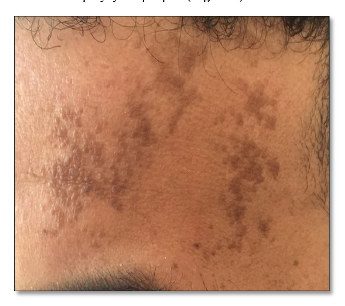
Figure 1. Case 1: VEN on the forehead.

30 year old man presented with multiples papules on his forehead that he had had since he was thirteen. On clinical examination, we observed multiples hyper pigmented, keratosis and polycyclic plaques (Figure 1).