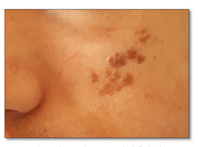
Figure 2. Case 2: VEN on the left cheek.

11 year old boy consulted for similar lesions on the left cheek. The lesions had been present since five years. Physical examination finds some brownish papule coalesce to form a serpiginous plaque ( Figure 2 ).