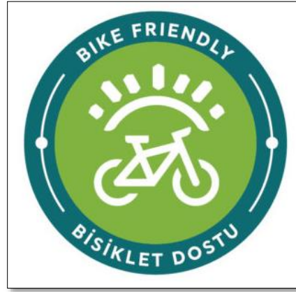
Figure 1. Bicycle-Friendly Accommodation Facility Logo.

Finally, İzmir, which attracts attention with its magnificent ancient cities, unique natural landscapes, and countless bicycle routes, will host the EuroVelo & Cycling Tourism Conference, which brings together all stakeholders in the cycling tourism industry, from 11-13 October 2023. Industry professionals who will participate in the conference will stay in facilities that have the "Bike Friendly Hotel" certificate. (Figure 1).