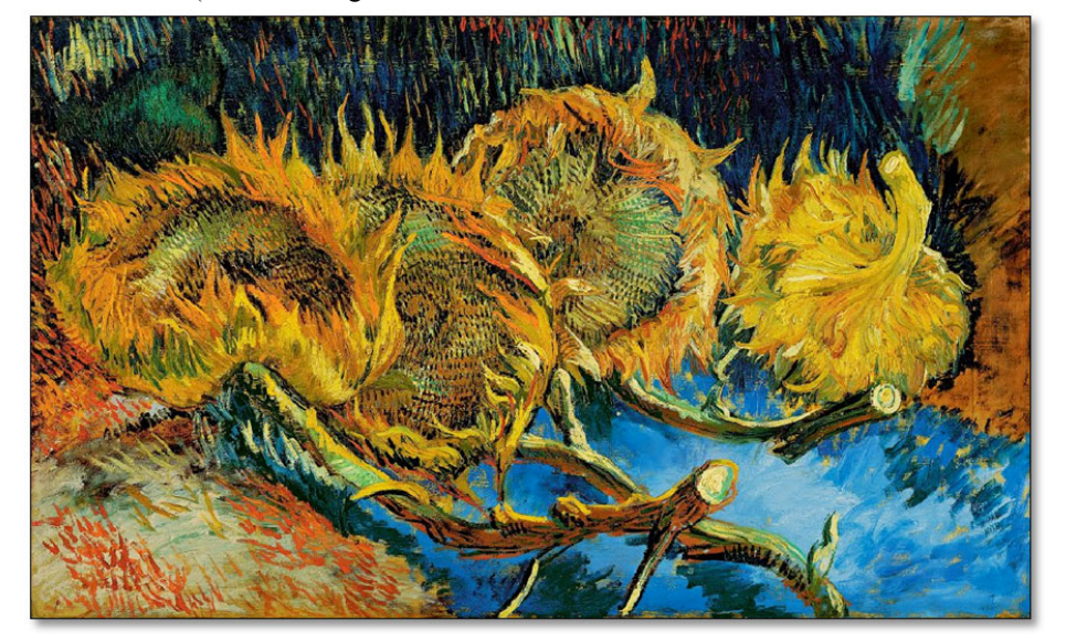
Figure 4. Van Gogh. Some museums have a proper climatization system according to the 'Hypokausten' technique to protect ancient wooden figures of Jesus Christ and paintings. Also, the visitors are partly protected against air-born infections but not droplet infections. Keep distance.

In museums with a 'Hypokausten-Technick' one can enjoy not ruined figures of Jesus Christ and nice paintings of famous painters ( Figure 4 ) without being afraid of an airborne infection.