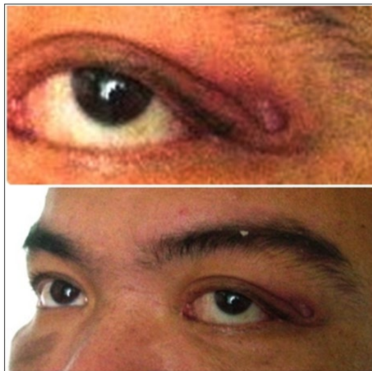
Figure 2. F2=LE=Mild ptosis. Foreign body 5 × 10 mm.

One week after surgery: lid slit=4 mm, no diplopia. 2 weeks latter: lid slit=8mm and both eyes open normally ( Figure 2 and the patient's left eye).