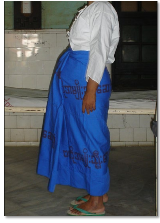
Figure 6. After operation.

Her weight upon discharge was 47.8 kg. Therefore, her cyst assumed to be 42.2 kg which is close to her body weight (Figure 6).