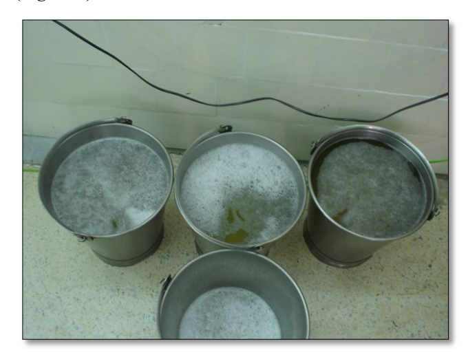
Figure 4. Aspirated straw colored fluid after surgery.

31/2 buckets of straw colored fluid (1 bucket can fit in 15 L) (Figure 4).