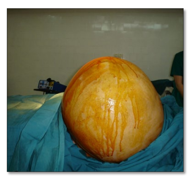
Figure 3. Left huge ovarian cyst probably benign before operation.

Appropriate necessary investigations were proceeded as the patient was about to go for surgery. The electrolyte changes were not remarkable and the serum albumin level had not changed much. Serum CA 125 was not raised as well. The planned operation (total abdominal hysterectomy with left ovariotomy and right salpingo-oophorectomy) was agreed with the patient.