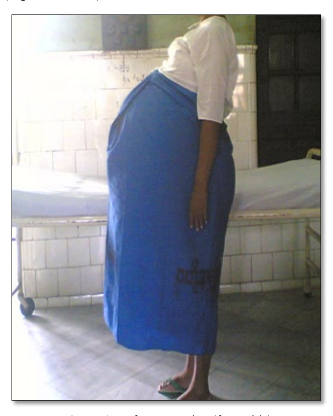
Figure 1. Before operation (from side).

On physical examination, she was average sized in our health standard, not cachexic and fair hydration. Obviously, she cannot sit properly, move freely and lie down comfortably. Noted body weight was 90 kg on admission (Figures 1 and 2).