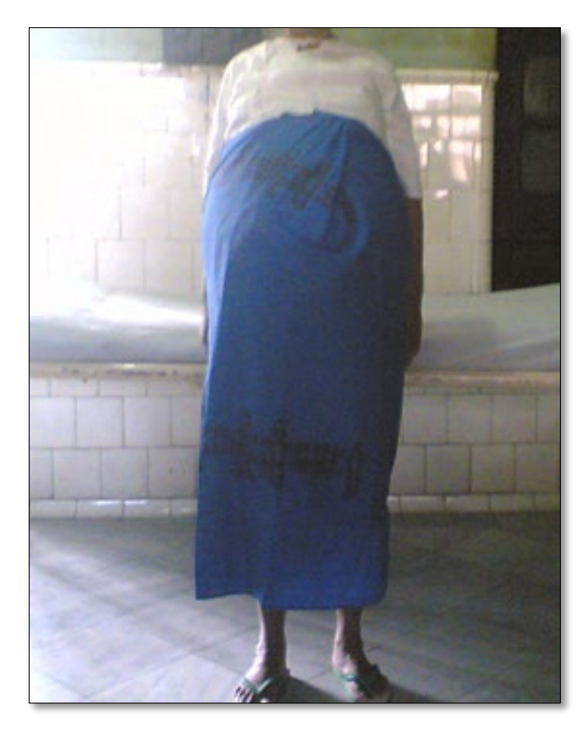
Figure 2. Before operation (from front).

She was apparently well apart from an extremely huge mass protruding from her abdomen. It revealed no abnormal finding during general and systemic examination. Her vital signs were stable. While performing the abdominal examination, there was a huge mass filling the whole abdomen. The skin over the mass was not thin, but, distended veins could be seen on lateral sides. Umbilicus was flat. The mass itself was felt tense with equivocal fluctuation sign, well-defined margin, smooth surface without tenderness and negative shifting dullness. On percussion, there was dullness over the mass. Speculum examination was performed quickly just to rule out cervical lesions as she did not go for screening for logistic reasons. We did not proceed to vaginal and per rectal examination not to make her discomfort and painful because of internal examination.