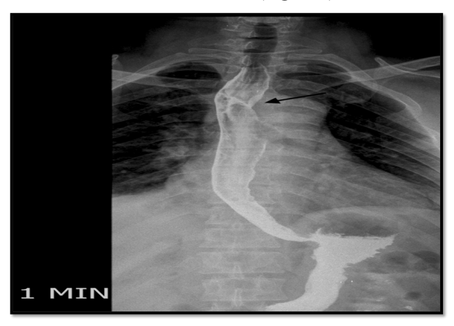
Figure 1. Timed barium esophagogram at 1 minute showed dilated esophagus, an air fluid level and delayed transit of contrast in esophagus along with pencil like indentation at the level of third thoracic vertebra (arrow).

A 47-year-old male from middle east presented with complain of dysphagia to solids and liquids, occasional regurgitation without chest pain and weight loss. Esophagogastro- duodenoscopy (EGD) showed resistance at LES with dilated esophagus. Timed barium esophagogram showed dilated esophagus, air fluid level and delayed transit of contrast in esophagus along with pencil like indentation at the level of third thoracic vertebra ( Figure 1 ).