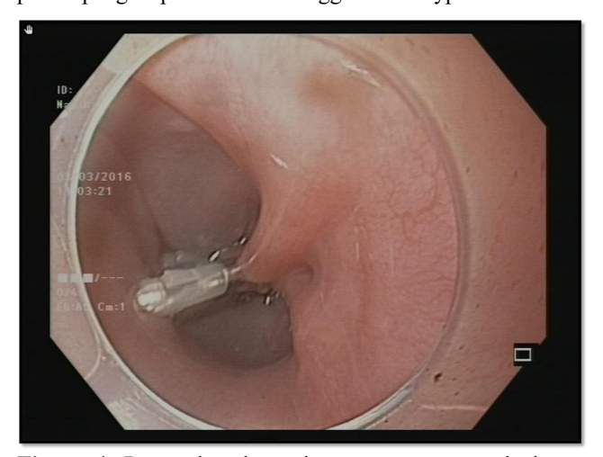
Figure 4. Per oral endoscopic myotomy mucosal closure with clips in the case with achalasia and dysphagia lusoria.

On follow up he had intermittent episodes of dysphagia which was managed with simple diet modification to soft, small quantity diet. He is asymptomatic on follow up.