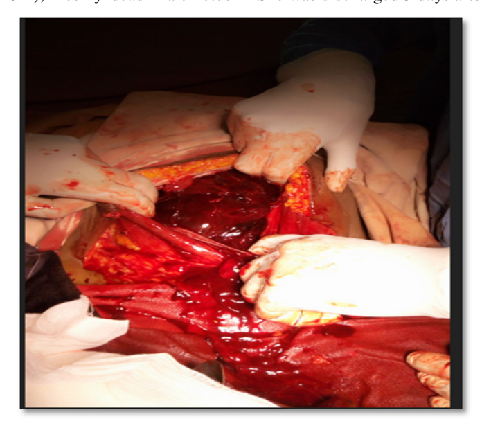
Figure 1. Large hematoma anterior to the uterus upon entry to peritoneal cavity.

(weight 2800 grams) in intact amniotic sac was found in abdominal cavity ( Figure 2 ). Placenta was found covering lower uterine segment and cervix ( Figure 3 ). There was upper uterine segment transverse uterine rupture which was about 15 cm involving both sides uterine arteries ( Figure 3A & B ). There was no evidence of Couvelaire uterus and no demonstrable congenital uterine anomaly. Rest of the pelvis looked normal, with no evidence of endometriosis or adhesions. About 1.5 1 hemoperitoneum sucked out and hysterectomy done. She received one unit of blood during intraoperative and one unit during the post-operative period. She was discharged 5 days after surgery.