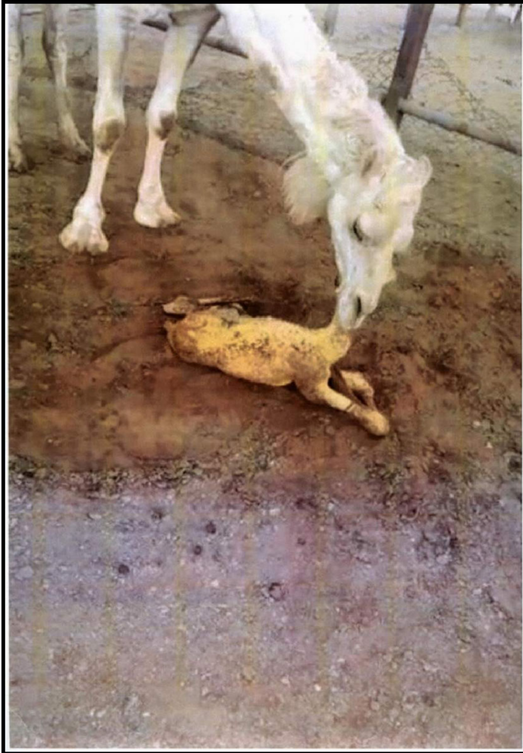
Figure 1. Meconium Yellow stained calf been licked and identified by his dam.