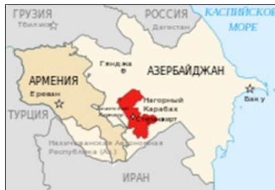
Figure 1. Map of Azerbaijan.

The purpose of our research is to study the methods of soil and fertilizer cultivation, improve soil fertility and winter wheat cultivation technology, which ensures higher yield and quality of grain in the Ganja-Gazakh zone of Azerbaijan (Figure 1).