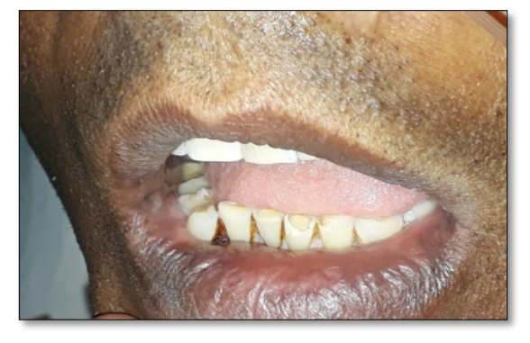
Figure 3. Limited mouth opening.

We planned for awake oral fibreoptic intubation. I.V. line was secured and inj. glycopyrrolate 0.2 mg was given 30 min prior. Xylometazoline nasal drops were used for nasal mucosa vasoconstriction. Total dose of lignocaine was calculated according to body weight and half of the dose was kept for SAYGO and rest was used for nebulization and other blocks [5]. Patient was nebulized with 2 ml of 4% lignocaine diluted to 5 ml with NS for 30 min (Figure 4). Cotton pledgets soaked in 2% lignocaine were used to block glossopharangeal nerve. 10% xylocaine spray was used to spray both nostrils and tongue. Injection dexmedetomidine 0.25 mcg /kg/min was started 15 min prior to procedure. Patient was taken to O.T.; standard ASA monitoring was started with recording of baseline parameters. Patient was explained the procedure on table. Oxygen through nasal cannulae @4 L/min was started. Fibreoptic scope was introduced through the mouth, structures were visualized but epiglottis was not seen. Multiple pockets of pharyngeal soft tissues were seen and were very confusing, on searching for epiglottis for 5 min, it was finally seen extremely pushed towards right side. But it was not possible to go beyond epiglottis as it was closely approximated to posterior pharyngeal wall and could not be centralized.