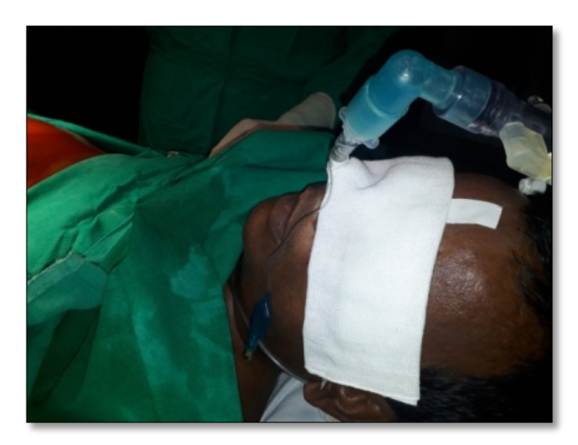
Figure 7. After intubation.