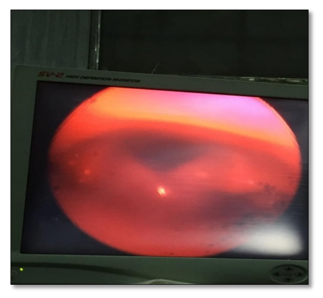
Figure 5. Glottic view.

We changed our plan and went for nasal fibreoptic intubation. A rubber catheter lubricated with xylocaine jelly was inserted through left nostril and found to be patent. The FOB was inserted and epiglottis was seen in extreme right. 2-3 ml of 2% xylocaine was sprayed over epiglottis. We changed our position by standing on left side of patient and asked the patient to stick out his tongue and with great difficulty and maneuvering posterior part of vocal cords were seen (Figure 5). 2 ml of 2% xylocaine was sprayed over vocal cords. After waiting for 30 s FOB scope was advanced and trachea was intubated (Figure 6). After confirmation of bilateral air entry Injection propfol 120 mg and injection vecuronium 6 mg was given. It took about 12 min to intubate the patient (Figure 7). Our patient was maintaining 99% SPO<sub>2</sub> and was calm and cooperative throughout the procedure.