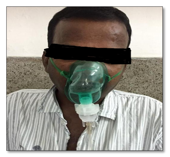
Figure 4. Nebulisation with 4% lignocaine.

We planned for awake oral fibreoptic intubation. I.V. line was secured and inj. glycopyrrolate 0.2 mg was given 30 min prior. Xylometazoline nasal drops were used for nasal mucosa vasoconstriction. Total dose of lignocaine was calculated according to body weight and half of the dose was kept for SAYGO and rest was used for nebulization and other blocks [5]. Patient was nebulized with 2 ml of 4% lignocaine diluted to 5 ml with NS for 30 min (Figure 4). Cotton pledgets soaked in 2% lignocaine were used to block glossopharangeal nerve. 10% xylocaine spray was used to spray both nostrils and tongue. Injection dexmedetomidine 0.25 mcg /kg/min was started 15 min prior to procedure. Patient was taken to O.T.; standard ASA monitoring was started with recording of baseline parameters. Patient was explained the procedure on table. Oxygen through nasal cannulae @4 L/min was started. Fibreoptic scope was introduced through the mouth, structures were visualized but epiglottis was not seen. Multiple pockets of pharyngeal soft tissues were seen and were very confusing, on searching for epiglottis for 5 min, it was finally seen extremely pushed towards right side. But it was not possible to go beyond epiglottis as it was closely approximated to posterior pharyngeal wall and could not be centralized.