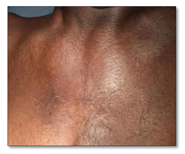
Figure 1. Bony growth over clavicles.