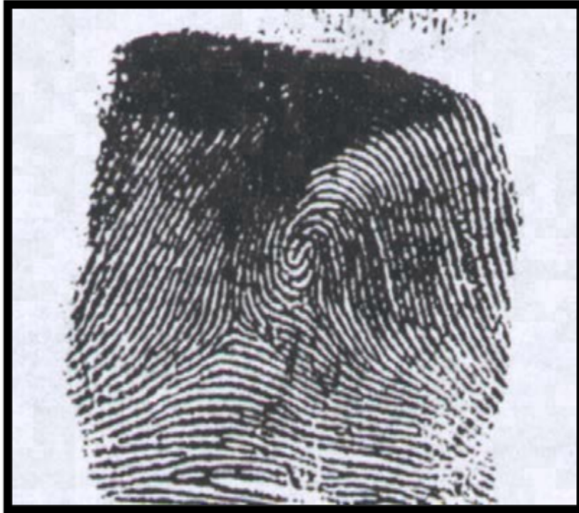
Figure 1. Billie Holiday's left middle fingerprint.

other words, February 28 th 2021, the night of the broadcast was on a Sunday additionally, February 28 th was on a Sunday in the year of 1915. The years of 1915 and 2021 both had 28 days in the month of February!