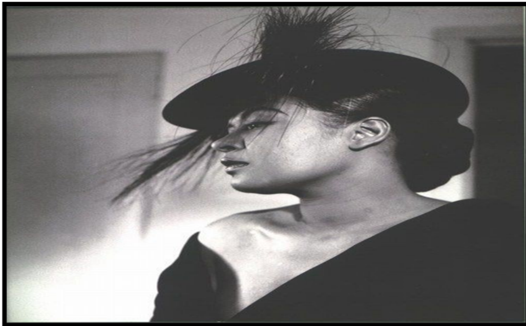
Figure 2. Billie Holiday.