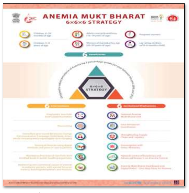
Figure 1. Anemia Mukt Bharat at a Glance.

The Anemia Mukt Bharat (AMB) program was launched with a target to bring the prevalence rate to1%. The 6*6*6 strategy of the currently operational AMB has 6 beneficiaries & out of these six, two categories match with AMB. The intervention's categories that match with the AMB are the children in the age group of 6-59 months, lactating mothers & pregnant women. The below-mentioned Figure 1 gives the glance of AMB'.